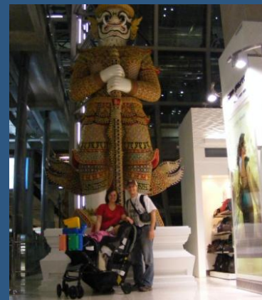
Our Arrival in Bangkok

"Partnering to rebuild the broken foundation of Cambodia on the solid foundation of Christ!"