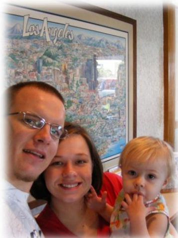
We spent a night in LA