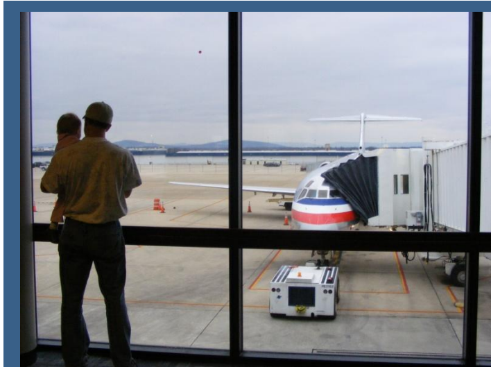
Preparing to board in Huntsville