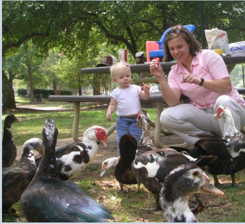
Feeding the ducks and geese at Big Spring Park in downtown Huntsville